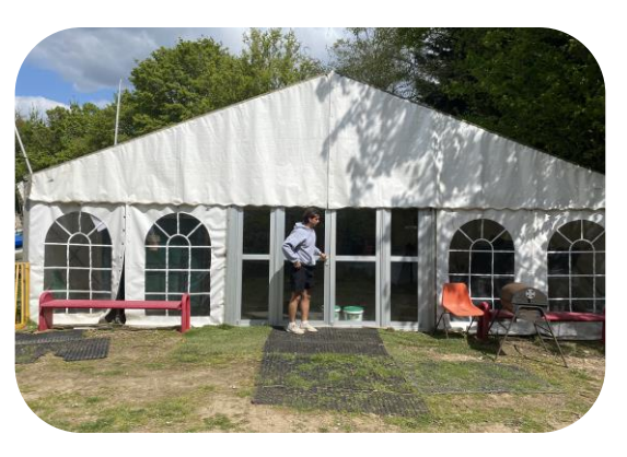
Marquee floored and prepared as a back up option for fitness based activities in bad weather at Stanborough Park