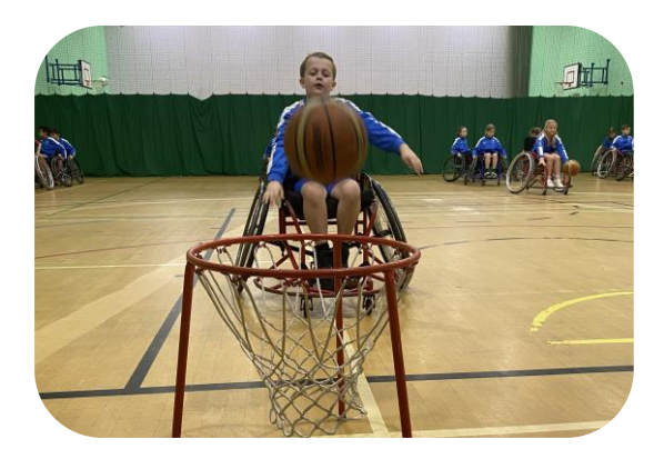
Paralympic Roadshows restarted in schools across Hertfordshire, with both indoor and outdoor options