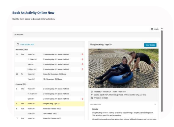
The launch of our new booking system, BookWhen, which is integrated into the website www.HDSF.co.uk/find-an/activity