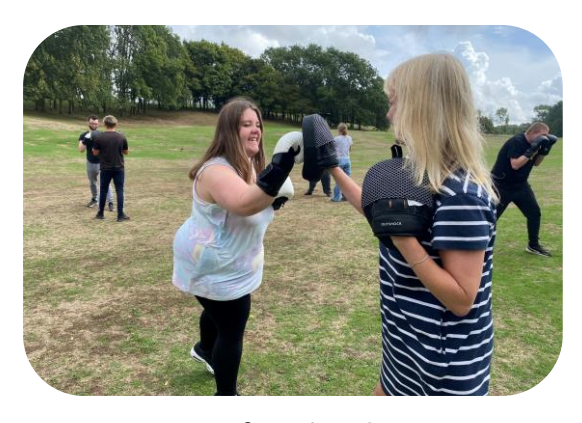
Boxercise is fast developing as a popular fitness activity with both young people and adults with disabilities