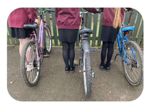
We developed cycling skills of 1634 children. 472 needed learn to ride support, 352 of these could pedal independently within 2 sessions